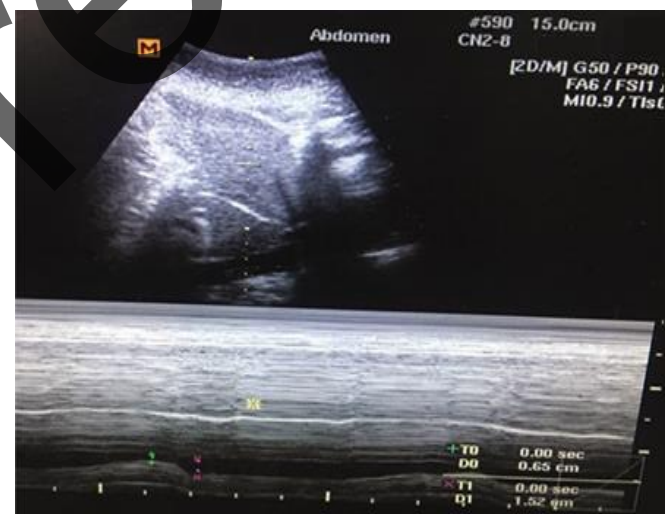
Figure 1: Measurement of inferior vena cava diameter using M- mode

All patients had their central venous catheters inserted aseptically in the internal jugular vein, and a chest x-ray confirmed their correct position. A critical care physician and a licensed practical nurse took the CVP readings for the study. A transducer is used to assess central venous pressure at the location where the fourth intercostal space and the midaxillary line meet. After zeroing, the transducer was kept open for a while so that blood could flow into the central venous catheter. The waveform of central venous pressure and the average central venous pressure in mmHg were displayed on the monitor.